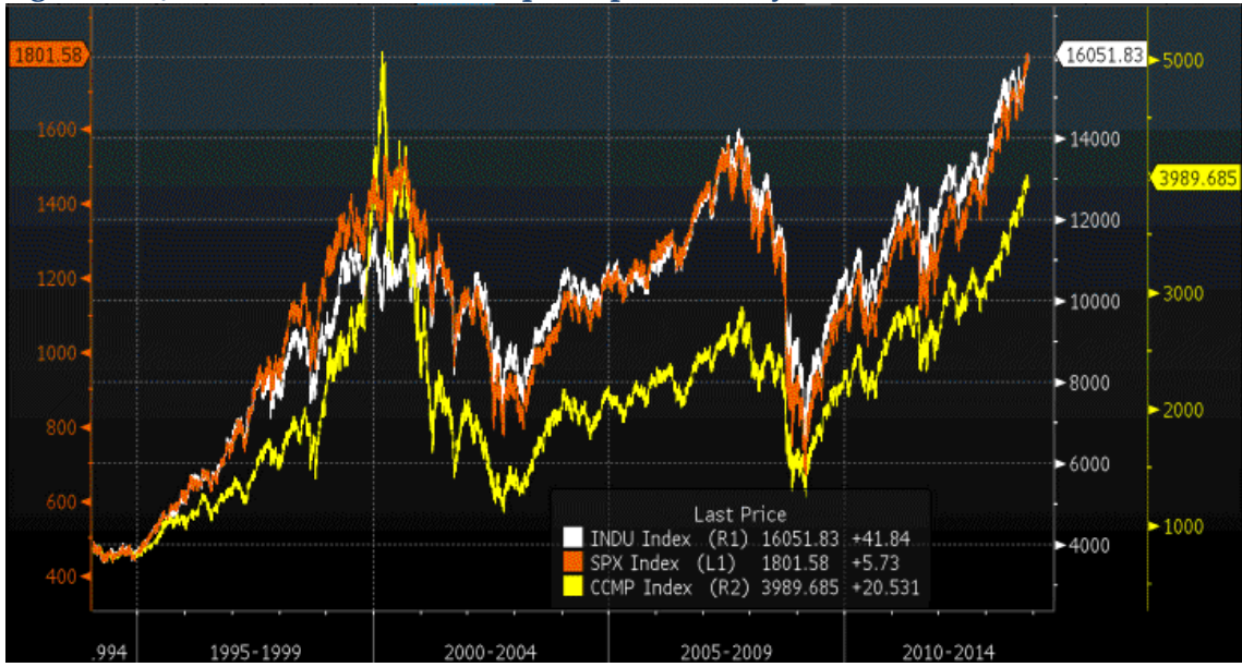
Figure 1: DJIA, S&P 500 and Nasdaq Composite – 20 years (1993 to 2013 YTD)