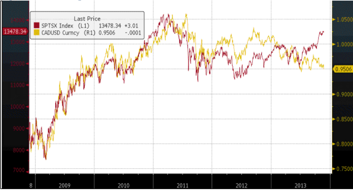
Figure 2: TSX Composite vs. C$ – 2008 to 2013

The TSX and C$ are going their separate ways as the index trades at its highest since July 2011 even as the C$ tests support at USD 0.95, a full 10 cents lower than its levels at that time. The C$ should recover next year, in our view, as global interest is reignited in the TSX, but even if it continues to flounder, a weaker loonie would be positive for Canadian corporate earnings.